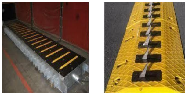
Fig -4: Tyre killer

The blocking segment will feature spikes positioned at a 60° angle and constructed from tempered steel. The spacing between the spikes, measured from their centers, should range from 100 mm to 200 mm, as illustrated in Figure 4 [6].