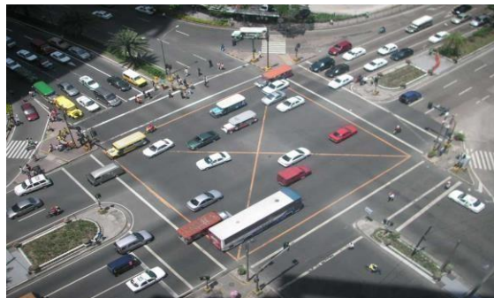
Fig -1: Traffic loaded intersection

This approach is entirely centered on making traffic lights fully adaptive through the use of a wireless sensor network [2]. According to this concept, traffic lights transition between red and green states based on traffic load, prioritizing traffic flow over fixed time intervals as shown in fig. 1.