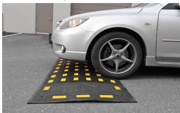
Fig -5: Speed Brakers

While speed breakers or bumps effectively reduce vehicle speeds, their use is sometimes controversial due to potential drawbacks. They can increase traffic noise, damage vehicles when driven over at high speeds, and slow down emergency vehicles [7]. Poorly designed speed bumps, especially those that are too high or have a steep angle (often found in private car parks [citation needed]), can be disruptive to drivers and challenging for vehicles with low ground clearance, even at low speeds. This motion is illustrated in Figure 5.