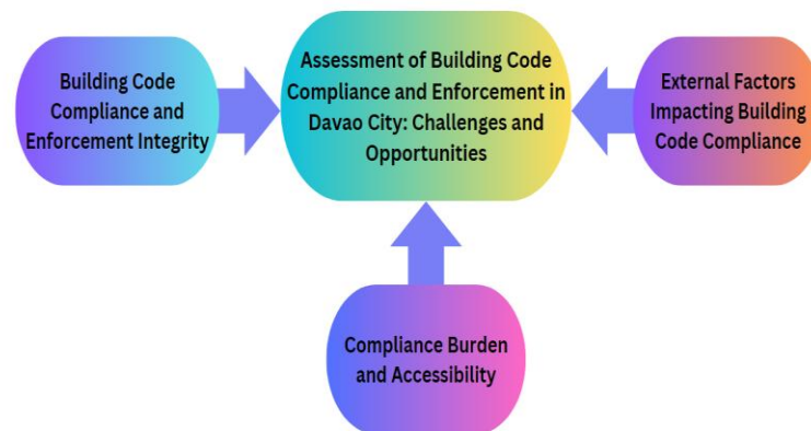
Figure 2. Assessment of Building Code Compliance and Enforcement