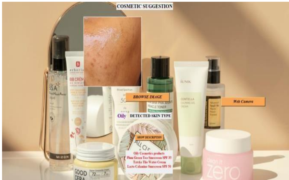
Figure 2: User Interface