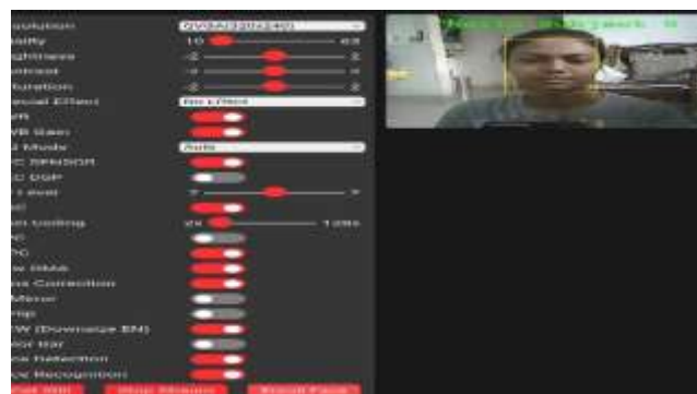
Figure:3 web server imgs stream