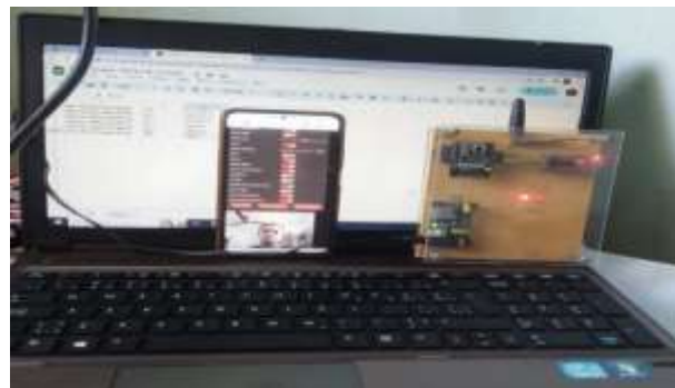
Figure:2 Hardware analytic result