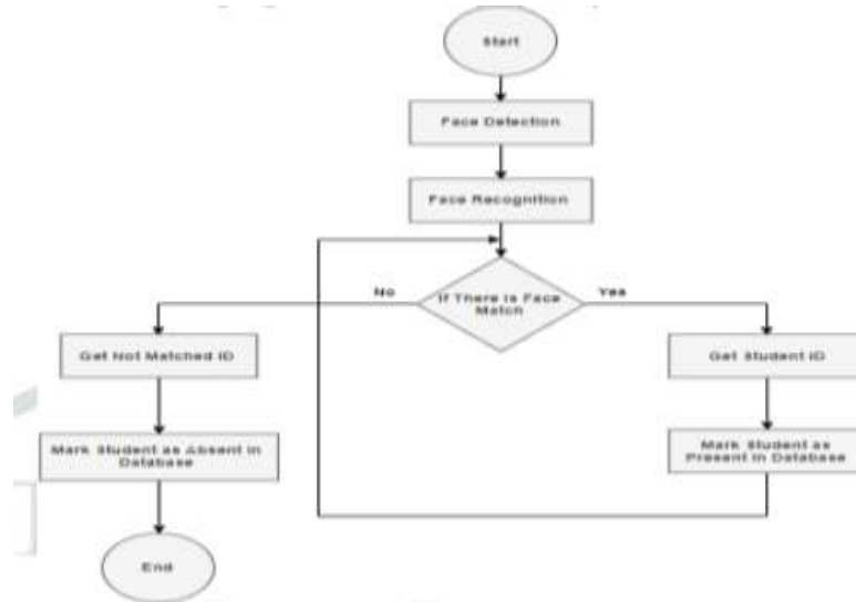
Figure 1: Flow of process

The pre-processing step is used to detect face and mark in database. Camera that detect a person and recognition face. If face matched then get student id and it mark as a present in data based. If there is face not match then get not match id and mark as student as absent in data based.