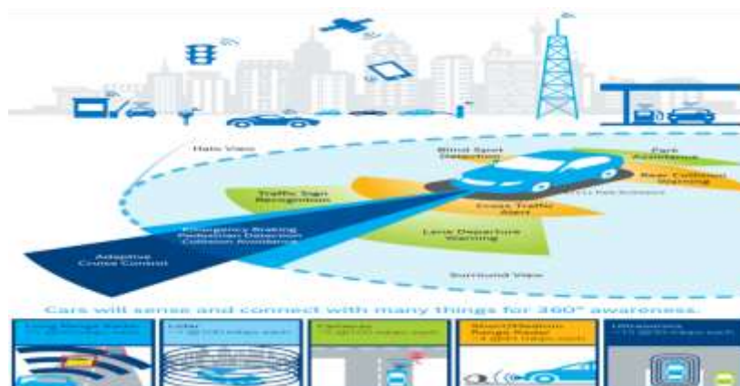
Figure 1: System Architecture

According to the annual Autonomous Mileage Report published by the California Department of Motor Vehicles, Waymo has logged billions of miles in testing so far. As of 2019, the company's self-driving cars have driven 20 million miles on public roads in 25 cities and additionally 15 billion miles through computer simulations. While the number of miles driven is important, it is the sophistication and diversity of miles accumulated that determines and shapes the maturity of the product. Additionally, the testing through simulation plays a key role in supplementing and accelerating the real-world testing [1]. It allows one to test scenarios that are otherwise highly regulated on public roads because of various safety concerns. It is an open-ended and highly configurable driving simulator that integrates the key feature of the procedural generation (PG). The simulator defines multiple basic roadblocks such as ramp, fork, and roundabout with configurable settings and a range of diverse maps can be assembled from those blocks with procedural generation, which is further turned into interactive environments