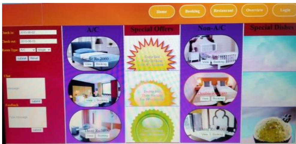
Fig 1. Feedback and views of room

In above figure we show the feedback box and view of rooms . after clicking on the room view we provide the booking form and using this form user can book room easily.