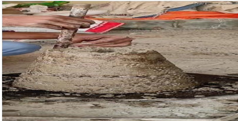
Fig. 4.9 Slump test