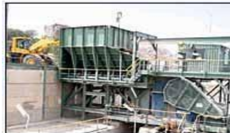
Fig 1.6 Load in the Primary Crusher.

The first step in turning construction and demolition waste into repurposed material is crushing. In this procedure, fragments of the concrete waste are broken. Jaw crushers or impacting mill crushers are typically the equipment used for the crushing operation. The primary jaw crusher will reduce the concrete waste to a size of around 3 inches. The materials will be broken to their largest size, which varies among 34 and 2 inches, using the secondary cone crushers. To extract all the scrap metal, magnetic conveyors are installed in every recycling crusher.