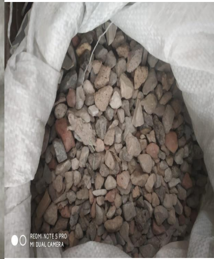
Fig 4.6 Demolition Waste of 20mm