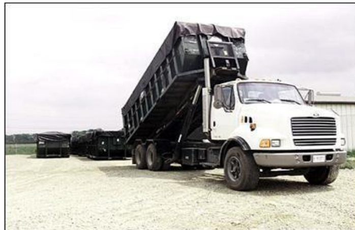
Fig 1.5 The Roll-off Container

Buildings and cement pavements are torn down, and the discarded concrete is then processed at recycling plants. The building and demolition materials are transported using roll-off containers and dump body trailers since they are economical and effective. Closed box trucks and covered containers are frequently used for this.