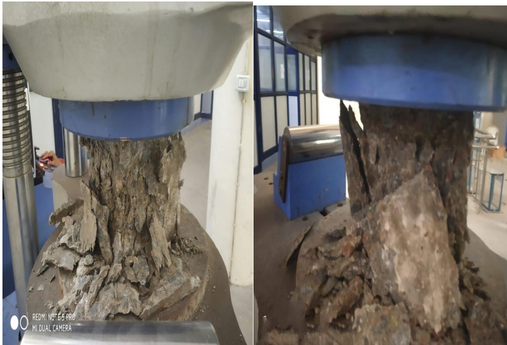
Fig 5.3 Different Types of Rupture