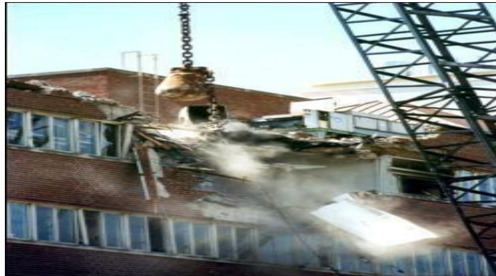
Fig 1.4 Destroying Ball

Destroying ball: The Destroying ball, which is suspended from a crawler crane, uses its impact energy to destroy the building.