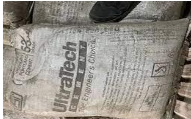
Fig 4.1 Ultratech Cement

The cement obtained in this way was evaluated the physical requirements in accordance with IS: 12269 respectively. The physical Features of cement are listed below in Table 4.1