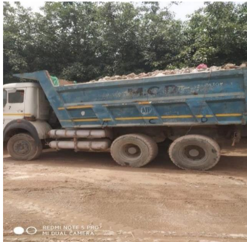
Fig 4.7 Transportation of Demolition Waste