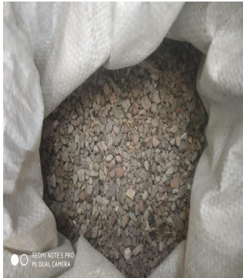
Fig 4.5 Demolition Waste of 10mm