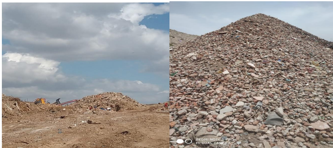
Fig 1.1 Demolition Waste

Reprocessing techniques for concrete and masonry waste are used in nations including the United Kingdom, the United States, France, Denmark, Germany, and Japan. The report suggests creating standards for recycled aggregate concrete and components in order to remedy this. By enabling manufacturers to produce goods of the desired quality and giving consumers the assurance of a minimum standard, this would promote consumer adoption.