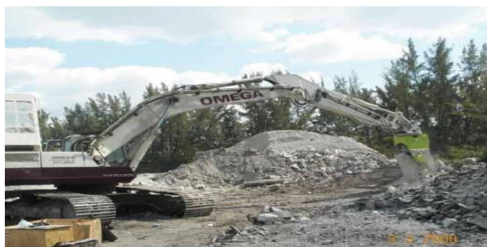
Fig 1.3 Long Boom Arm Hydraulic Crusher

Long boom arm mechanical hydraulic crusher: The concrete and steel reinforcing are broken down by the crushers using a long boom arm equipment.