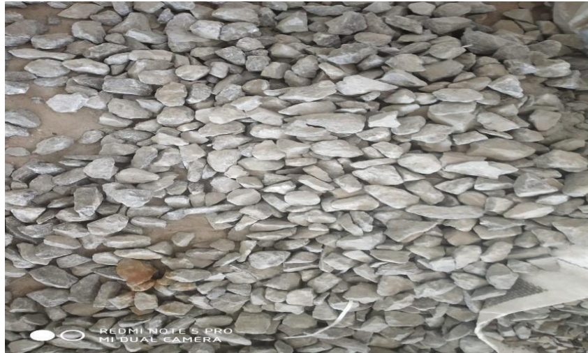
Fig 4.3 Coarse Aggregate

The term "coarse aggregate" often refers to the materials that are large enough to pass through a 4.75mm sieve. Local resources are employed to create the coarse aggregate. For this experimental with broken angular material with diameters of 10 mm and 20 mm are used.