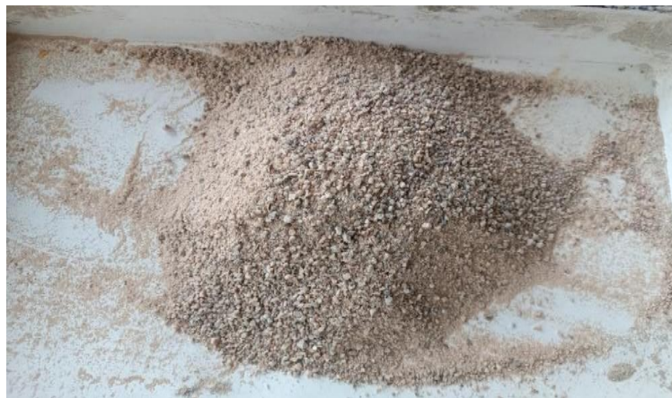
Fig 4.2 Fine Aggregate

M Sand is a granular material used in construction that is mostly made up of mineral and stony fragments that have been finely split. It is therefore utilised as fine aggregate in concrete.