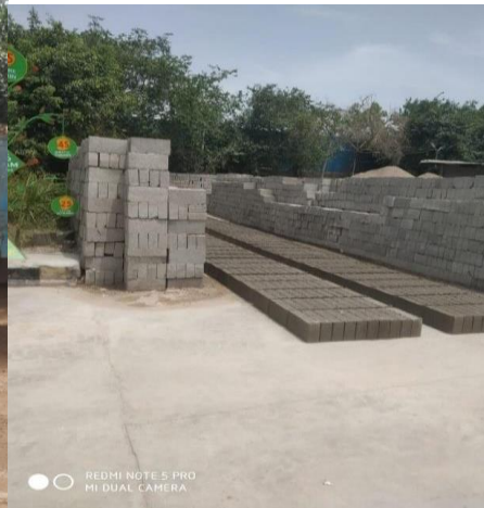
Fig 4.8 Made building blocks using Demolition waste