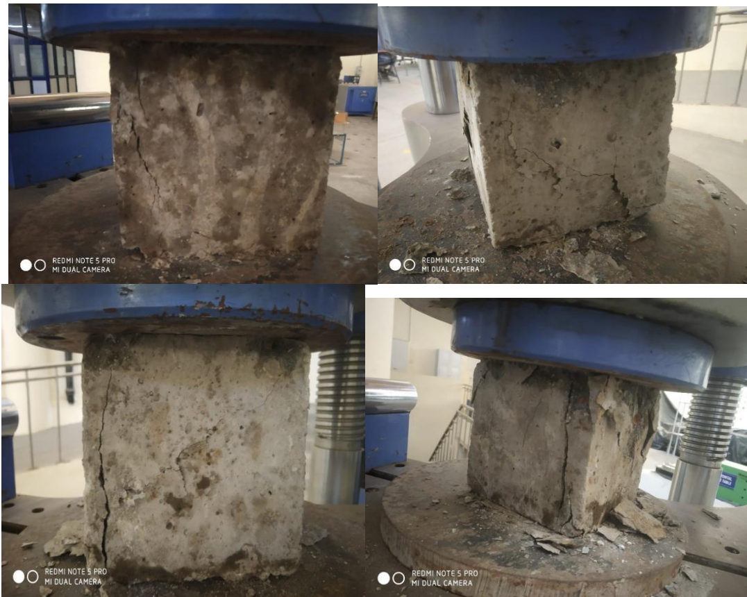
Fig 5.2 Different Types of Cracks

Cube compression tests were performed to determine the effects of replacing the coarse aggregate with demolition waste. Replacement ratios of 0%, 10%, 20%, 30%, 40%, 50%, and 100% were taken into account. Both the 7 and the 28 days were used for the examinations.