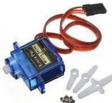
Fig no.4 Servo Motor

Arduino Uno, a versatile microcontroller board based on the ATmega328P chip, serves as the cornerstone of a medicine vending machine's functionality. With its robust capabilities, Arduino Uno handles a multitude of tasks essential for the smooth operation of the vending system. Acting as the central nervous system, Arduino Uno interfaces with user input devices, such as buttons or touchscreens, to interpret commands for medication selection and dispensing. Furthermore, it efficiently manages the inventory of medications stored within the machine, keeping track of quantities and updating stock levels in real-time. Arduino Uno also takes charge of controlling the dispensing mechanism, ensuring precise and accurate delivery of medications according to prescribed dosages. Additionally, it facilitates communication with the RFID module, enabling remote interaction with the vending machine via SMS or calls. Through this communication channel, users can request medications, check availability, or receive important notifications regarding their medication regimen. Moreover, Arduino Uno implements robust security measures to safeguard the vending machine, incorporating authentication protocols to prevent unauthorized access and ensure the integrity of the system. In essence, Arduino Uno's pivotal role in orchestrating the various components and functions