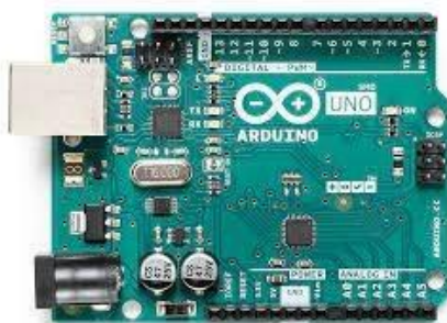
Fig no.3 Arduino UNO

The reader emits radio waves to communicate with the tag and read its data. RFID tags can be active, passive, or semi-passive. Active tags have their power source and can transmit signals over longer distances. Passive tags rely on the reader's electromagnetic field to power them and have a shorter read range. Semi-passive tags also rely on the reader for power but have a battery to power their internal circuitry. RFID systems operate at different frequencies, including low-frequency (LF), high-frequency (HF), and ultra-high-frequency (UHF). Each frequency has its advantages and is suitable for different applications.