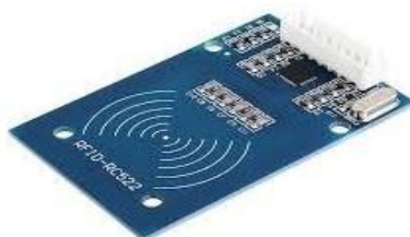
Fig no.2 RFID

RFID (Radio-Frequency Identification) is a technology that uses electromagnetic fields to automatically identify and track tags attached to objects. An RFID system consists of three main components: a tag or transponder, a reader or interrogator, and an antenna. The tag contains a microchip that stores data and an antenna to communicate with the reader.