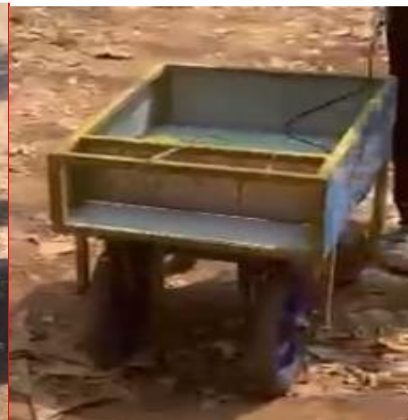
Testing 6kg load (Bluetooth control)