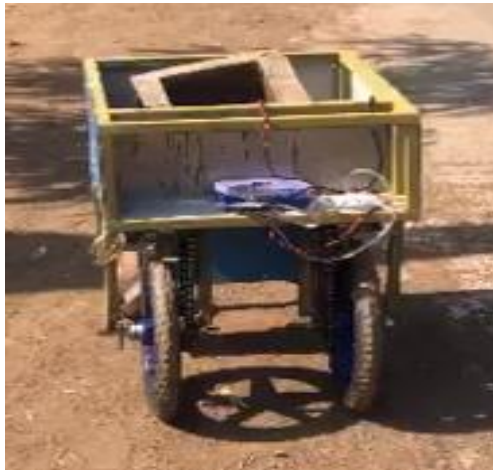
Photograph of Testing in farm