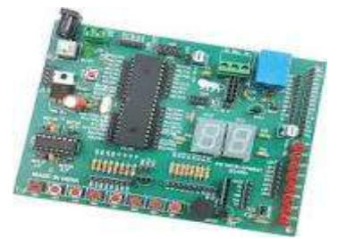
Fig.1. Micro Controller

Operating based on temperature, speed, and current inputs to monitor the operation of motor and control it.