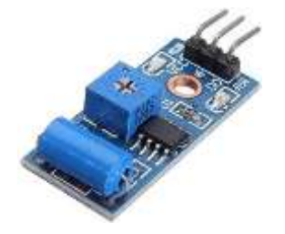
Fig.3. Vibration Sensor

It provide a protection from Imbalance in motor and give protection from damaging it.