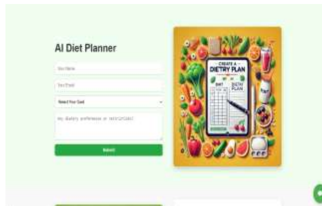
Fig:5 AI Diet Planner

The image showcases the homepage of the NutriTrack website, promoting its AI-powered personalized diet planner. It encourages users to achieve their fitness goals through customized meal plans tailored to their needs. With a user-friendly interface and a "Start Planning Now" button, it invites users to begin their journey toward a healthier lifestyle.