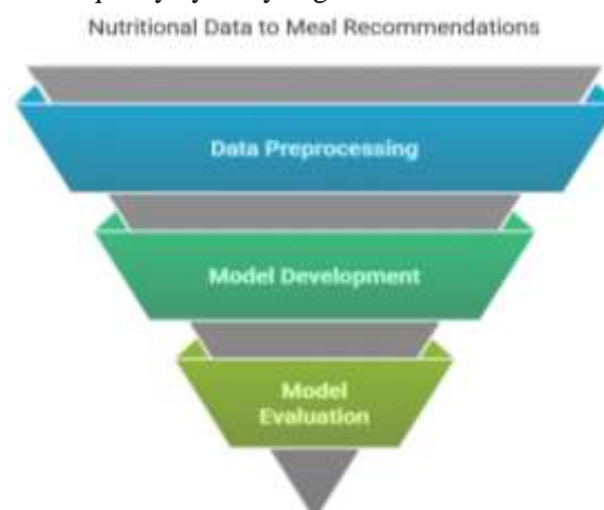
Fig:1 Nutritional Data to Meal Recommendations.

4.2 Machine Learning Model Development- The development of NutriTrack's machine learning model focuses on creating a robust system capable of predicting user dietary preferences and generating personalized meal recommendations. The model leverages advanced deep learning algorithms, particularly neural networks, to analyze complex patterns within the nutritional data and user input.[5] By training on historical user data, the model learns to identify correlations between user characteristics—such as age, health conditions, dietary restrictions—and their meal choices. This enables the system to predict and suggest meals that align with individual user profiles. The model's performance is evaluated using metrics such as accuracy, precision, and recall to ensure its effectiveness in making relevant recommendations. Continuous refinement is achieved through iterative training, incorporating new user data and feedback to enhance the model's predictive capabilities. Additionally, techniques like collaborative filtering are integrated to improve recommendation quality by analyzing similarities between users and their meal preferences.