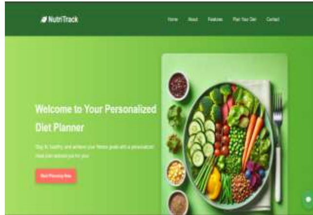
Fig:4 Home Page

The bar chart shows the success category distribution after applying SMOTE (Synthetic Minority Over-sampling Technique) to the NutriTrack AI meal recommendation dataset. Unlike before, all categories are now balanced, with equal representation. This ensures a fairer model training process, reducing bias and improving prediction accuracy for all meal recommendations.