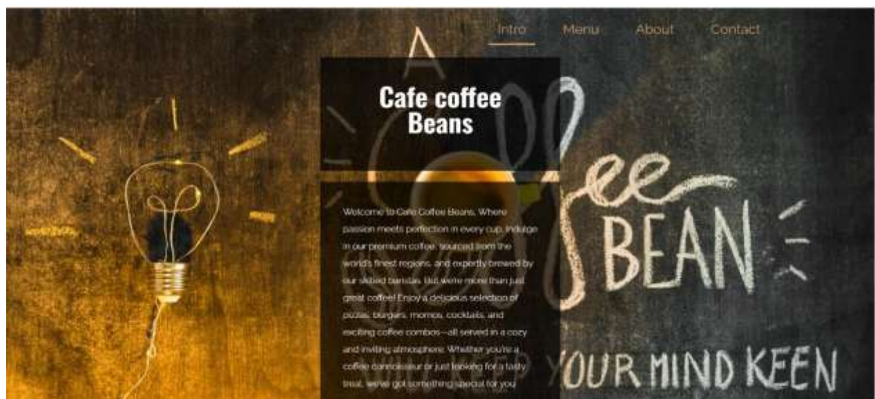
Fig:1 Home Page

Home page introduction:- Come to Cafe Coffee Beans, where love meets skill in each sip. Savor our fine coffee, picked from the best spots on earth and made by our expert baristas.