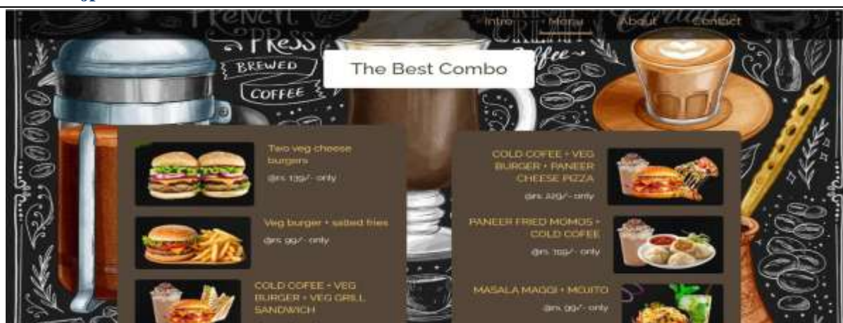
Fig: 2 Menu

Menu & Best Combos :- The cafe site will show food to suit all tastes. It will have many foods and drinks, like special burgers and cool mojitos. Burgers, Cheeseburger, A juicy beef patty with melt-y cheddar, fresh lettuce, tomato, pickles, and special sauce in a soft bun. BBQ Burger: A tender beef patty with bacon, tangy BBQ sauce, lettuce, and onions. Veggie Burger: A chickpea and veggie patty with vegan mayo, lettuce, and tomato. Mojitos: Classic Mojito: Fresh mint, lime, sugar, and rum over crushed ice with soda water. Strawberry Mojito: Fresh mix with ripe strawberries for sweet and tart flavor.