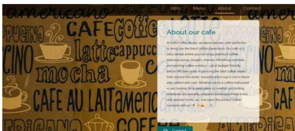
Fig:3 About Cafe

Menu & Best Combos :- The cafe site will show food to suit all tastes. It will have many foods and drinks, like special burgers and cool mojitos. Burgers, Cheeseburger, A juicy beef patty with melt-y cheddar, fresh lettuce, tomato, pickles, and special sauce in a soft bun. BBQ Burger: A tender beef patty with bacon, tangy BBQ sauce, lettuce, and onions. Veggie Burger: A chickpea and veggie patty with vegan mayo, lettuce, and tomato. Mojitos: Classic Mojito: Fresh mint, lime, sugar, and rum over crushed ice with soda water. Strawberry Mojito: Fresh mix with ripe strawberries for sweet and tart flavor.