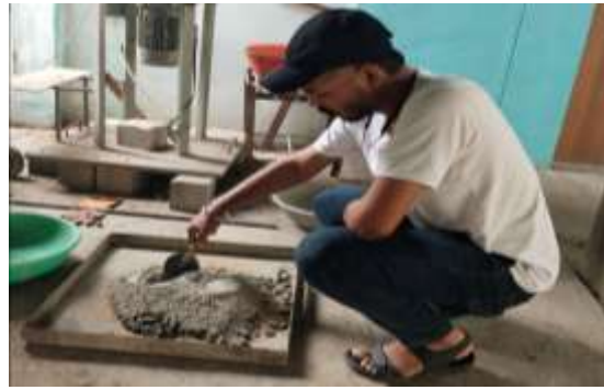
Figure: 2 batching of materials