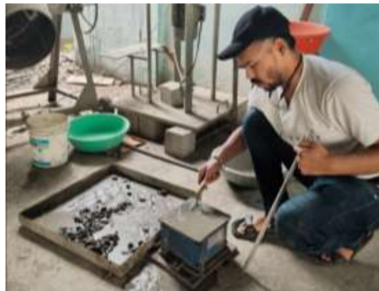
Figure: 4 placing of concrete in mould