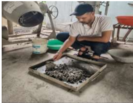
Figure: 3 mixing of materials