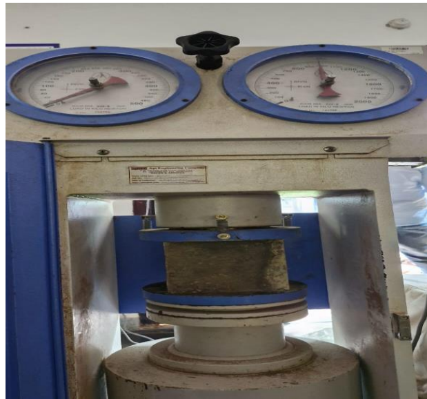
Fig.1 Compressive strength

The strength in compression has a definite relationship with all other properties of concrete In India cubical moulds of size 150mm *150mm*150mm had casted and tested for 7 days,14 days and 28 days. The test results are tabulated below.