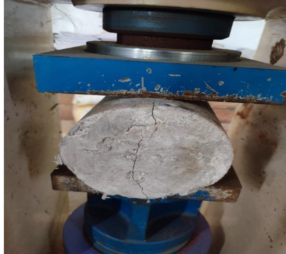
Fig.2 Split tensile strength

The split tensile strength obtained by testing the specimen for M30 grade of concrete to all the mixes designed for various replacement given below.