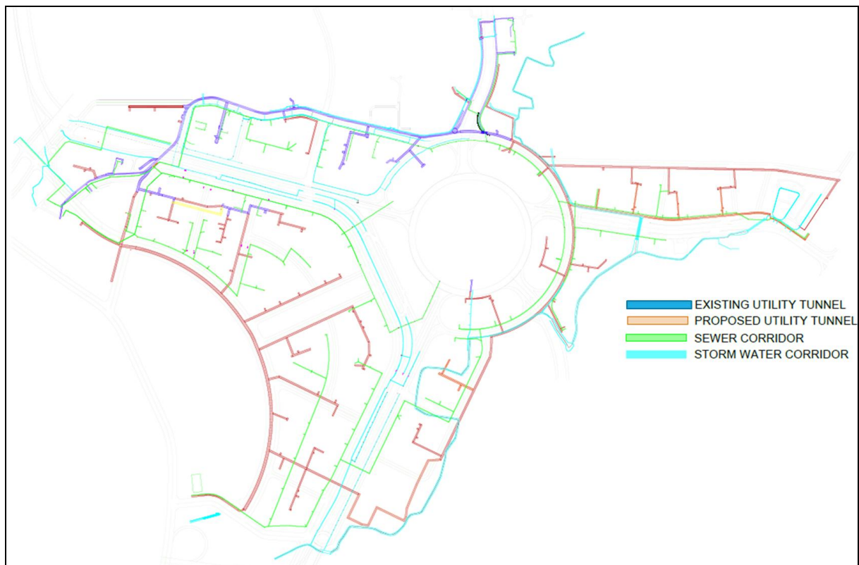
Figure 2: Present Water Network

At present the survey and information from the office suggest that the water supply network is being laid for three different purposes namely, irrigation, construction and treated water. The construction sites also have requirement for treated water for drinking purposes in the office and labor colonies, similarly they also need treated water for various complicated construction activities. This resulted in a network which is very random and not following any pattern. As