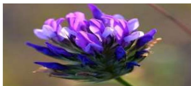
Fig No.5 Bakuchiol

Retinol is a highly beneficial active ingredient that has been scientifically shown to dramatically improve skin look when used properly and in the right formulation. The new natural retinol for vital and healthy skin, Bakuchiol, offers the same advantages as retinol but is more practical for sensitive skin that may be irritated and have a poor tolerance to retinoids.