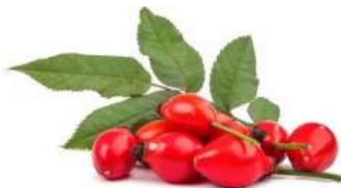
Fig No12. Rosehip seed

The most significant internal and extracellular aqueous phase antioxidant in the body is vitamin C (L-ascorbic acid). [23] The complex set of enzymatic and non-enzymatic antioxidants that work together to shield the skin from reactive oxygen species (ROS) includes vitamin C, the most abundant antioxidant in huma