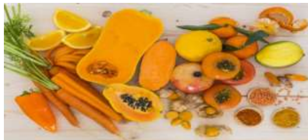
Fig No.4 Carotenoids

\alpha -tocopherol, or vitamin E, is a strong antioxidant. This antioxidant can be applied topically to protect both acute and chronic UV damage. Only tocotrienol and alpha-tocopherol, the natural components of vitamin E, effectively reduce skin roughness when administered topically.