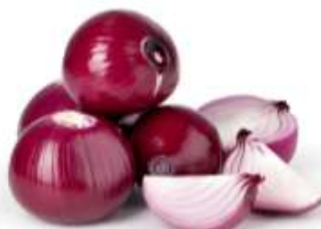
Fig No.7 Red onion

Quercetin is a flavonoid that comes from plants. Fruits, vegetables, leaves, and grains are examples of sources. The term, which comes from quercetum (oak forest), has been in use since 1857. Quercetin is the most prevalent flavanol in the diet. Quercetin functions as an immunomodulator and has anti-inflammatory and antioxidant properties. It has been observed that a diet high in quercetin prevents the growth of skin cancer, mouth carcinogenesis, colonic neoplasia, and carcinogen-induced rat mammary cancer. vtumor development in mice using three models of skin carcinogenesis when topical treatment is used.