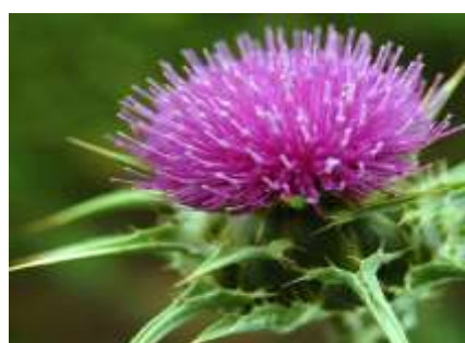
Fig No 9. Milk Thist

Milk thistle seed's active ingredients show that it is good for the skin. These consist of fatty acids, such as linoleic acid, vitamin E, and silymarin, which is actually a collection of three flavonoids. The flavonoid component silymarin is present in milk thistle ( Silybum marianum ) seeds. The three phytochemicals that make up silymarin are silybin, sildianin, and silicristin. The most potent phytochemical is silybin. Antioxidants and protection are provided by milk thistle seeds for the skin. Although it has been used for generations as a herb for detoxification, it has recently gained popularity as a potent skin-healing plant.