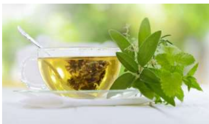
Fig No 13. Green tea (GT)

Green tea, which comes from the Camellia sinensis plant, is a popular beverage and an antioxidant. The most prevalent and physiologically active of the four main polyphenolic catechins is epigallocatechin 3gallate (EGCG). In addition to their antioxidant properties, the green tea polyphenols (GTP) have anti-inflammatory and anti-carcinogenic properties. GTP can be applied topically or taken orally. Green tea is arguably the most researched antioxidant, with several in vitro and in vivo investigations.