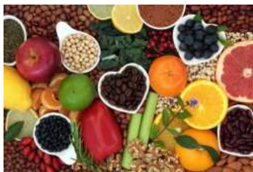
Fig No15: Polyphenol

Resveratrol is one of thousands of different kinds of polyphenols that can be found in fruits, vegetables, green or black tea (also known as flavonoids), and other botanicals. According to Dr. Klein, these substances "have anti-inflammatory, immunomodulatory, and antioxidant qualities to prevent UV-induced skin photodamage." According to studies, applying and consuming products high in polyphenols topically helps repair DNA damage, enhance our skin's natural defenses against oxidative stress, and delay the onset of aging. [27]