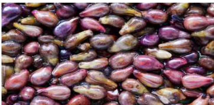
Fig No.3 Geape seed

OPC (proanthocyanidin) inhibits DNA mutations. Additionally, OPC inhibits elastase, preserving the skin's elastin integrity. It also works in concert with flavonoids, phenolic acids, and vitamins C and E to preserve and restore them. Research has shown that OPC in cream form is efficient at preventing the harmful effects of UV radiation from the sun. The primary defense against free radical species, which are the primary cause of many undesirable skin alterations, is provided by flavonoids and phenolic acids. It is generally known that they can be used to treat various skin conditions as well as to beautify and enhance the appearance of the skin. There is a constant need for protection from ultraviolet (UV) radiation and prevention of its negative effects because it can result in sunburns, wrinkles, decreased immunity to infections, premature aging, and cancer. [21]