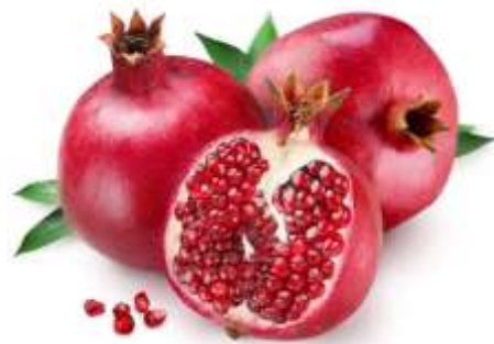
Fig No 14. Pomegranate

The juice, seed, and peel of the fruit Punica granatum are among the parts from which pomegranate extracts can be made. The phenolic components in particular have strong antioxidant properties. It has been demonstrated that topical administration of the peel extract restores the in vivo activity of the enzymes catalase, peroxidase, and superoxide dismutase. In vitro , the fruit extract has been demonstrated to mitigate UVA-mediated damage and offer protection from the harmful effects of UVB light. Many skin care products contain pomegranate extract. [26]