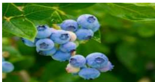
Fig No.6 Blueberries

Resveratrol is a member of the stilbene class of polyphenolic chemicals. Resveratrol is a fat-soluble substance that can exist in both cis and trans forms. Resveratrol is a polyphenolic phytoalexin that occurs naturally. It was discovered that resveratrol mediated anti-inflammatory effects, acted as an antioxidant and antimutagen, and caused human promyelocytic leukemia. differentiation of cells. Furthermore, it prevented carcinogenesis in a mouse skin cancer model and the formation of preneoplastic lesions in carcinogen-treated mouse mammary glands in culture.[23]