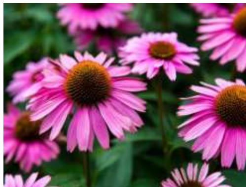
Fig No.8. Purple coneflower

In SKH-1 mice, apigenin was found to be efficacious in preventing UVA/UVB-induced skin carcinogenesis. They may also have advantageous antioxidant qualities and shield the plants from UV rays and diseases. abundant source of apigenin, an antioxidant. A common plant flavonoid found in fruits, vegetables, herbs, and beverages is apigenin. rich source of apigenin antioxidants Echinacea purpurea, that purple coneflower [23]