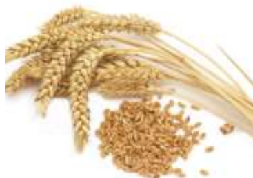
Fig No11. Triticum vulgare (wheat germ)

Vitamin E, also known as \alpha -tocopherol, is an antioxidant that may shield plant and animal cell membranes from damage caused by light. It has been demonstrated that topical application of these antioxidants to the skin reduces both acute and chronic photodamage. Only the natural forms of vitamin E, alpha-tocopherol and tocotrienol, can significantly reduce wrinkle depth, facial line length, and skin roughness when administered topically. Vitamin E administered topically improves the stratum corneum's ability to bind water and hydrate it. The damaging collagenase enzyme, which regrettably rises in aging skin, is decreased by alpha-tocopherol. In addition to being an emollient, vitamin E scavenges free radicals. [23]