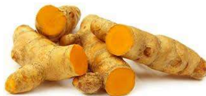
Fig No10. Rhizome of Turmeric ( Curcuma longa )

The yellow, odorless pigment known as curcumin was extracted from the turmeric ( Curcuma longa ) rhizome. Curcumin has antioxidant, anti-inflammatory, and antitumoral qualities. It also helps with cosmetic conditions including dyspigmentation. [24]