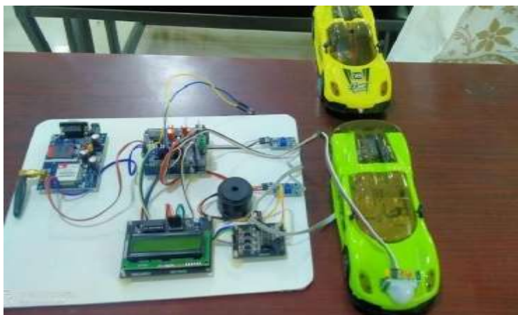
Fig 2: Complete Working Model of reducing the noise pollution caused by honking of vehicles