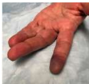
Figure 2. Photograph of a patient with thromboangiitis obliterans related to heavy smoking who developed purple discoloration of the index finger due to lack of blood flow in the small arteries.

Gangrene and Ulcers: Severe tissue necrosis leading to ulcers and potential gangrene in extreme cases.