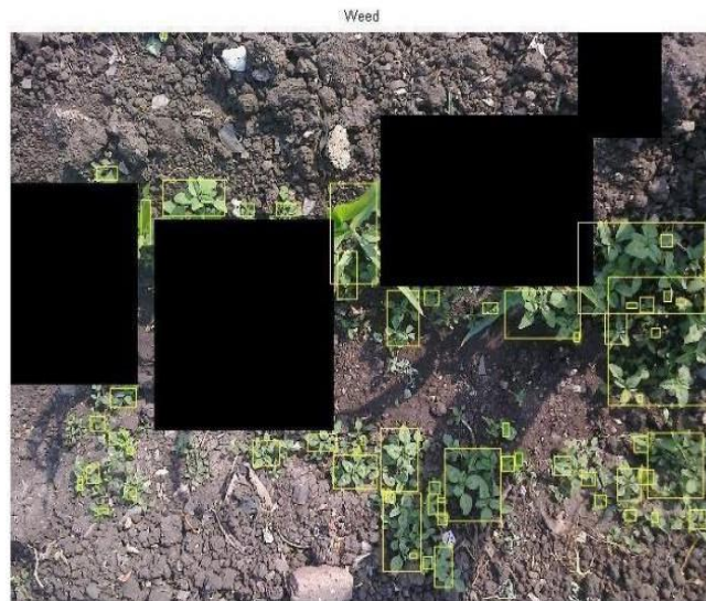
Fig.1 - Crop Detection by Machine Vision

[1] In weed detection based on leaf parameters, achieving an accuracy of 69 to 80%, specific features encompassing 11 shape parameters and 5 texture features are considered. The process involves acquiring a leaf image, preprocessing using Otsu's threshold method, and applying erosion and dilation to address object linking and holes. Discrimination analysis is then performed. However, this method's drawback lies in its tedious nature, necessitating a diverse set of weed samples for experimentation. On the other hand, crop detection by machine vision involves acquiring an image and employing the excess green algorithm to distinguish the crop from the background. A labeling algorithm groups similar pixels, and size-based feature extraction considers morphological characteristics. Despite its simplicity, this method tends to exhibit lower accuracy. Visual results are illustrated in Fig.1.