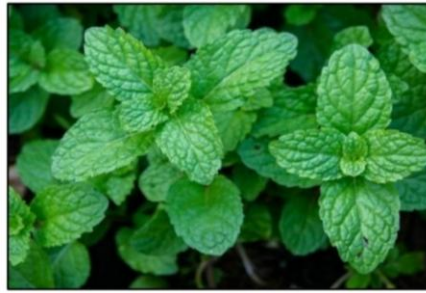
Fig .3 Mentha Piperita