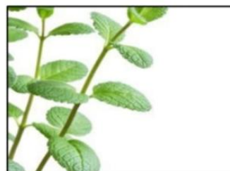
Fig.2 Mentha Piperita Leaves