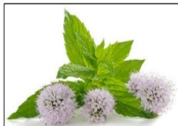
Fig.1 Mentha Piperita