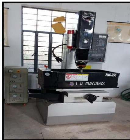
Figure 3.1: ZNC-250 Electric Discharge Machine

1 Electric Discharge Machine (EDM) For attaining the objective of the present work through the complete set of experimentation an Electric Discharge Machine, model ZNC-250 (die-sinking type) available in the workshop of the Mechanical Department, CTAE as shown in Fig 3.1 is used. ZNC-250 has the provisions of programming in the Z-vertical axis-control and manually operating X and Y axes. Divyol spark erosion oil-25 (specific gravity= 0.750 @ 29.5°C, Min.) was used as dielectric fluid.