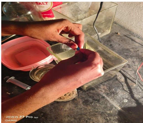
Figure 11: Buoyancy test of artemia cyst

5. Decapsulation: Decapsulation involves removing the hard outer shell, which can improve hatching rates, reduce the risk of bacterial contamination and make the nauplii more digestible.