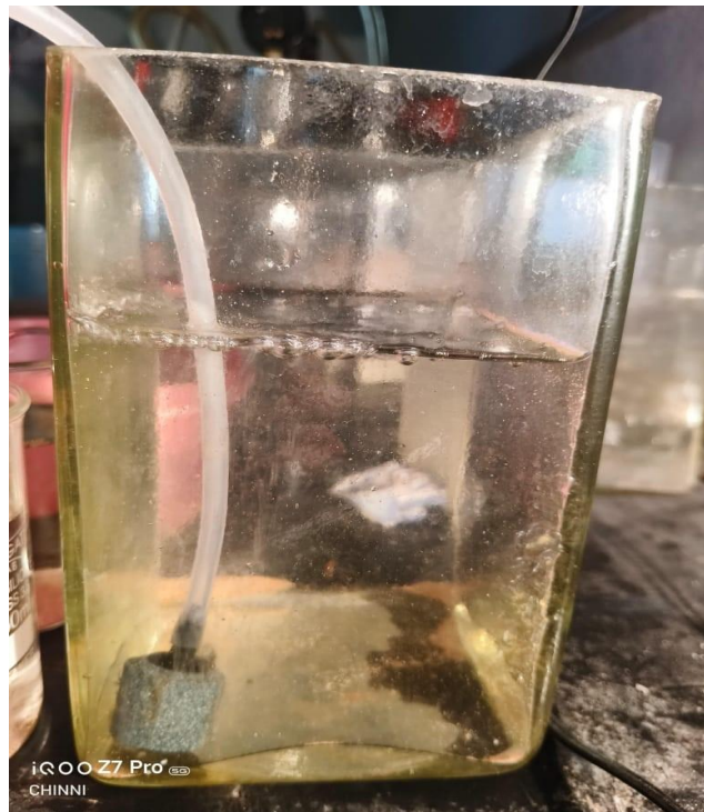
Figure 21: Stop aeration