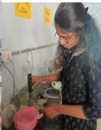
Figure 28: pH test