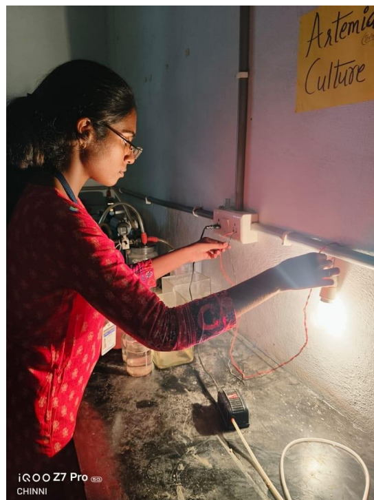
Figure 19: Lighting setup