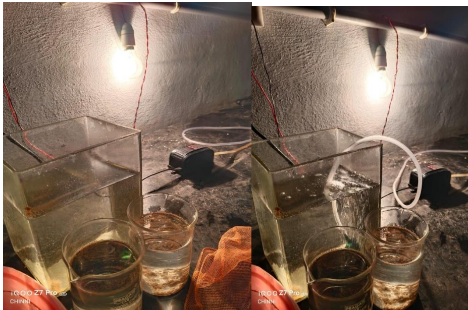
Figure 17,18: Hatching setup