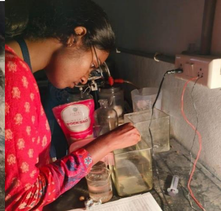
Figure 14: Adding rock salt for salinity maintenance