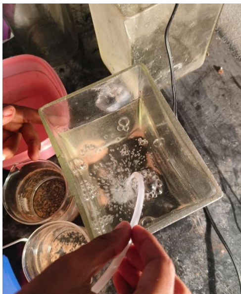
Figure 15: Installation of aerator