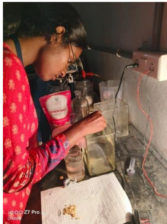
Figure 26: Feeding to artemia nauplii