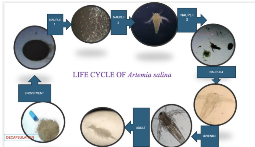
Figure 29: Life cycle of Artemia Salina