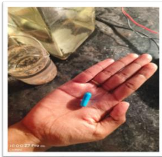
Figure 9: Visual inspection of artemia capsule