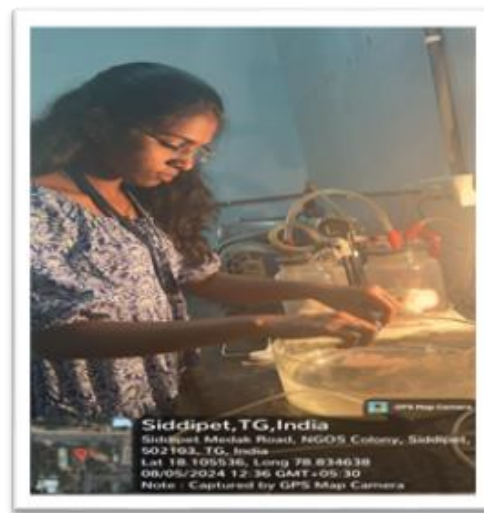
Figure 10: Decapsulation of artemia cyst

3. Buoyancy Test: A simple buoyancy test can help assess the quality. Mix the cysts in saltwater; good cysts will float while empty shells and debris will sink. Skim off the floating cysts for use.