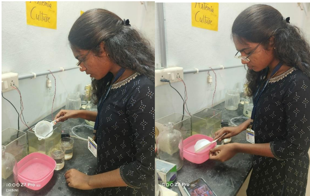
Figure 22, 23: Harvesting artemia using stainer