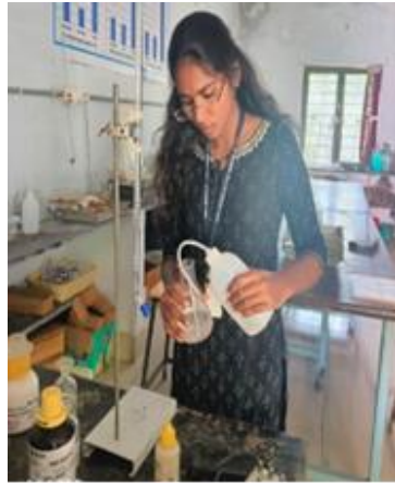
Figure 27: Salinity test

- Metabolic Imbalance If the temperature is too low, metabolic processes slow down, leading to reduced feeding and growth rates. If too high, it can increase stress levels and lead to higher mortality rates.