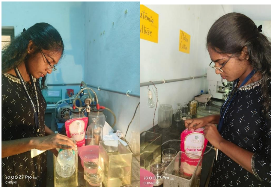
Figure 24: setting up culturing tank

- Transfer Method: Use a fine mesh net or a siphoning method to transfer the nauplii while minimizing stress and ensuring that they are not exposed to air for prolonged periods.