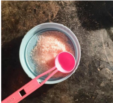
Figure 13: Rock salt