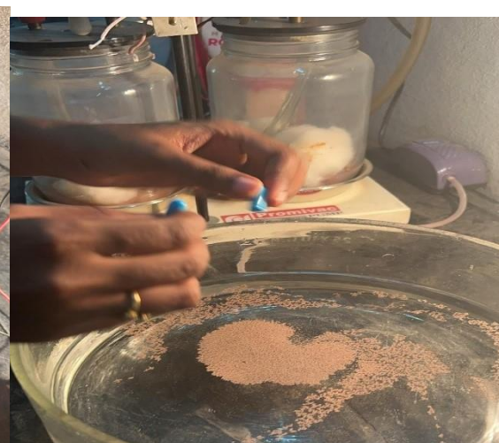
Figure 12: Eggs floating in the culture medium