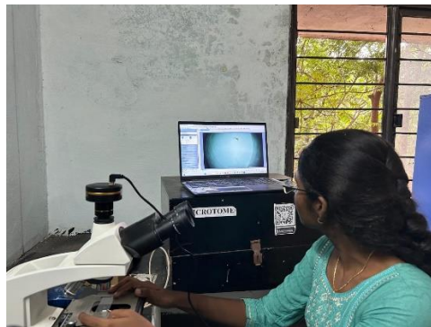
Figure 30: Microscopic view of Artemia